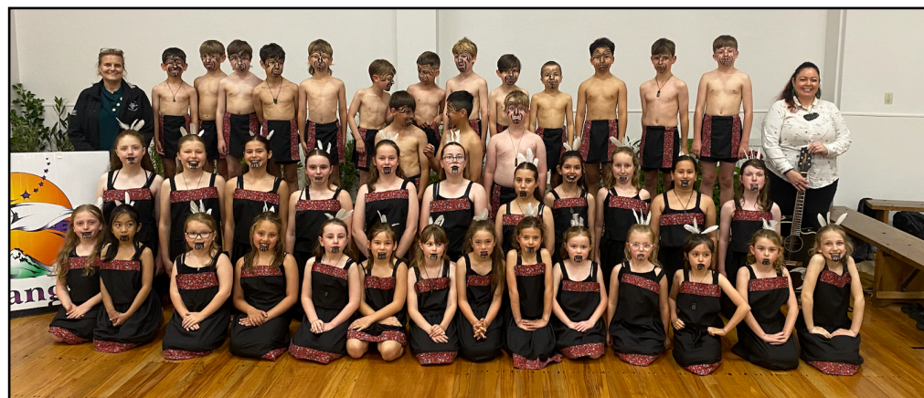
Our SJB Kapa Haka Roopu